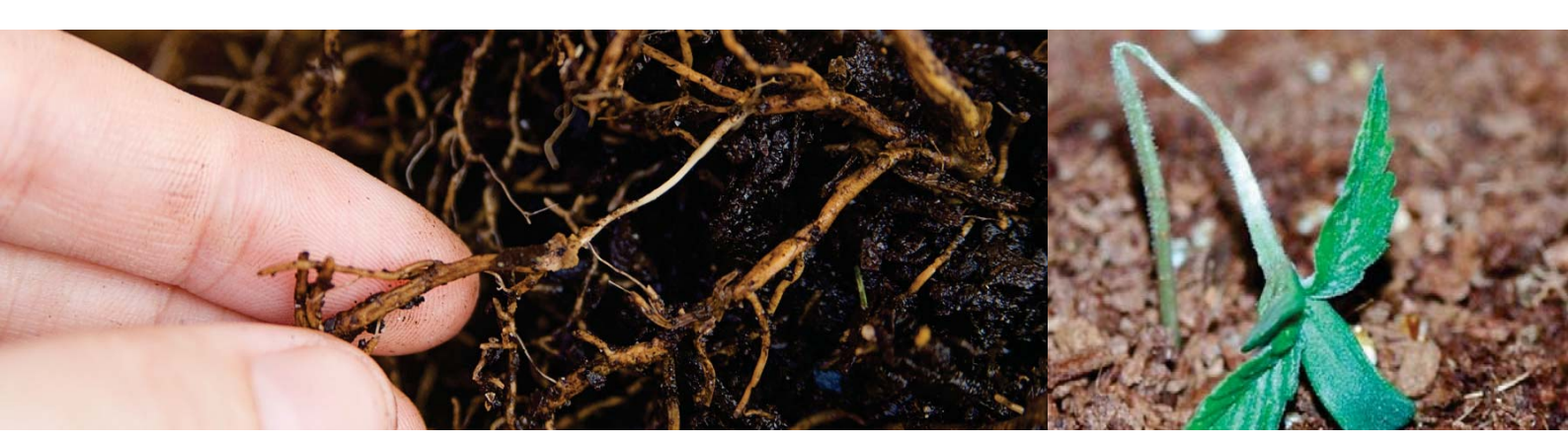
Check your roots against rot

The roots of pythium-infected plants will start to show signs of discoloration. Eventually, the outer layer of the roots will fall off to reveal a stringy, weak inner core. Obviously, the first thing you want to do is create environmental conditions that are not conducive to the formation of root rot. Keeping your hydroponic system clean or ensuring proper drainage of a soil-based medium is important in warding off <a href="mailto:pythium">pythium</a>.