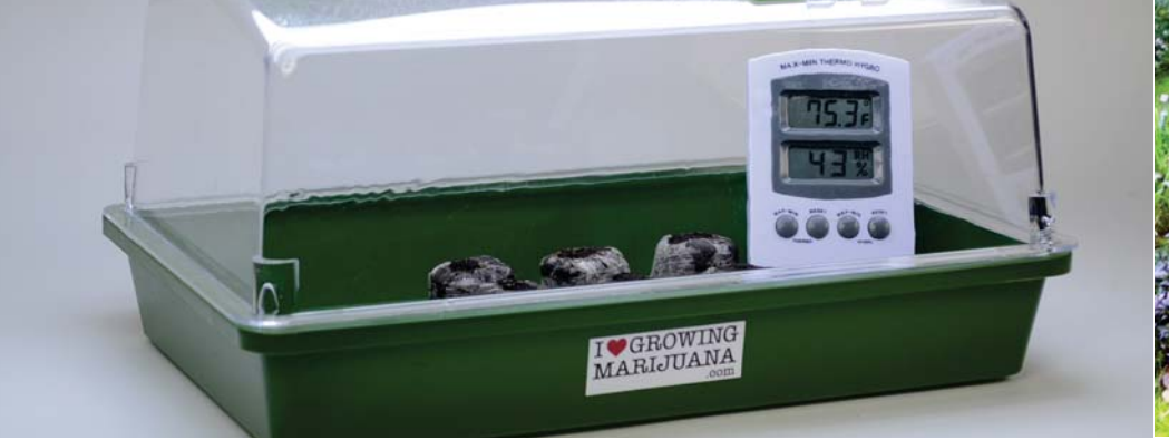
Make sure the germination process has the right temperature and humidity.

Sometimes the roots are ripped out of the soil and it's necessary to cover them with a nice layer of soil. You don't want the roots to be exposed to the air for too long. Plants can occasionally be damaged so much that lifting them to an upright position is unfeasible. Still, you can salvage the plant's life my being gentle with it. Read more here.