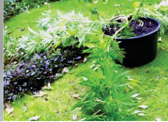
Even these plants can be fixed