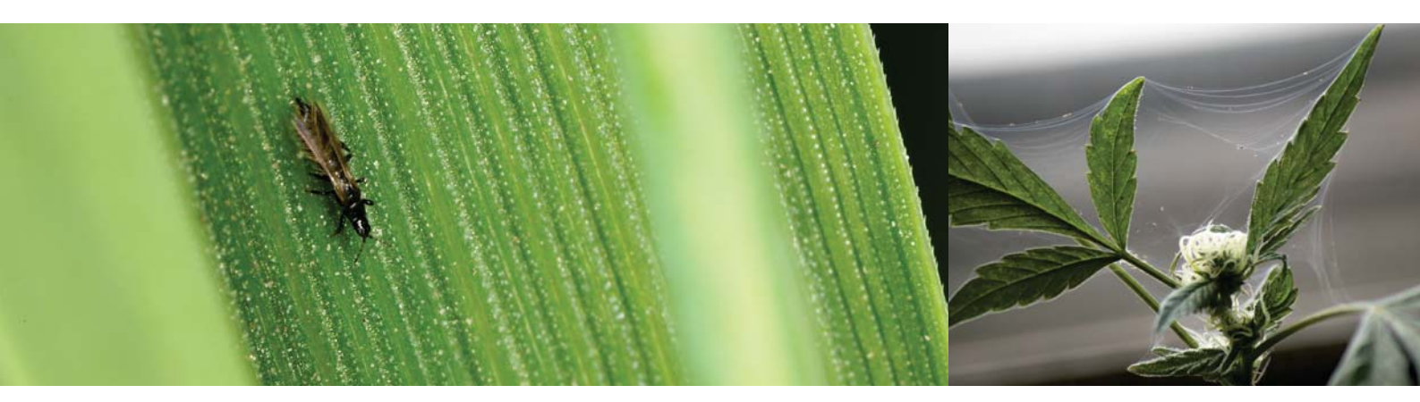
Make sure you eliminate thrips before it is too late.

There are plenty of natural remedies to this issue, including the introduction of some spider mite predators like ladybugs. If you don't have any ladybugs available, then you can actually buy some to curb the population of <u>spider mites</u>. You may also be able to simply spray the spider mites off the plants with a hose (if that's feasible) or a water and neem oil spray. They will be incapable of moving and will starve to death underneath the marijuana plants.