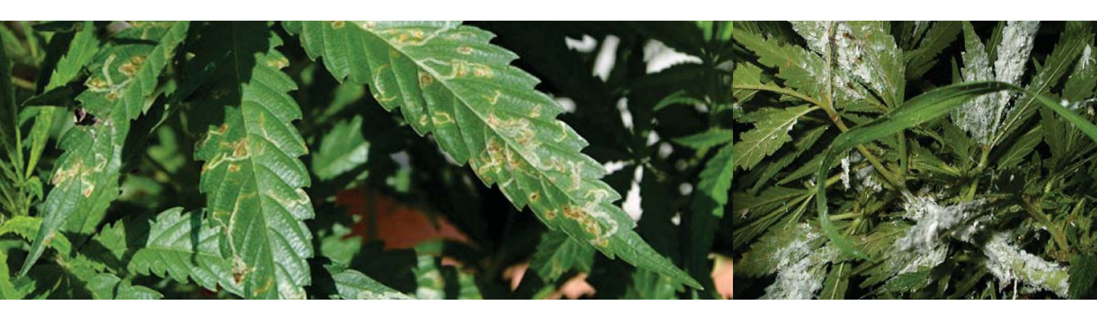
Make sure you know how to avoid leaf miners.

One of the things that keeps mealy bugs around is the protection of ants. If you find ants around your marijuana garden, then there's a good chance that you also have an infestation of mealy bugs. There are a number of ways to get rid of mealy bugs including taking them off physically or using homemade remedies. For more information on mealy bugs and how they affect your cannabis garden, check out the rest of this article.